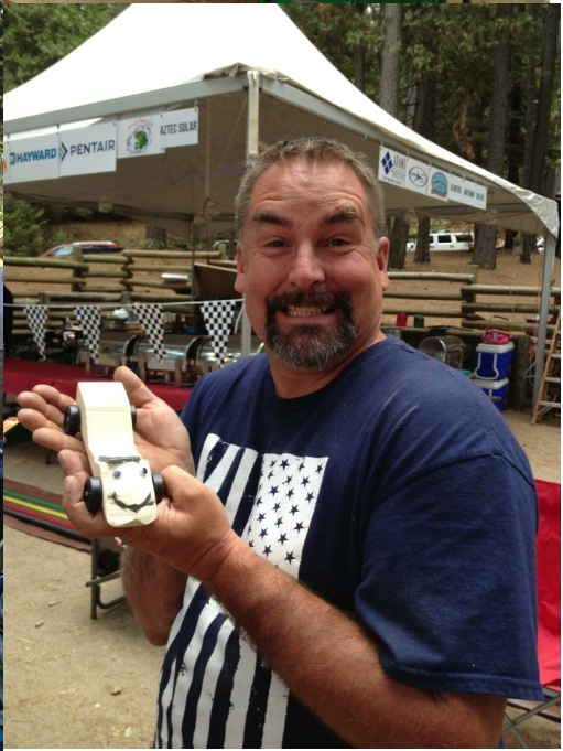
Santa's Summer Getaway September 2014