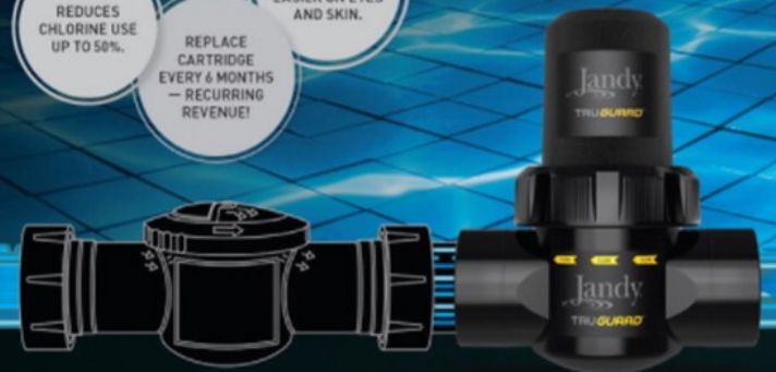
Jandy TruGuard + Salt Chlorinator